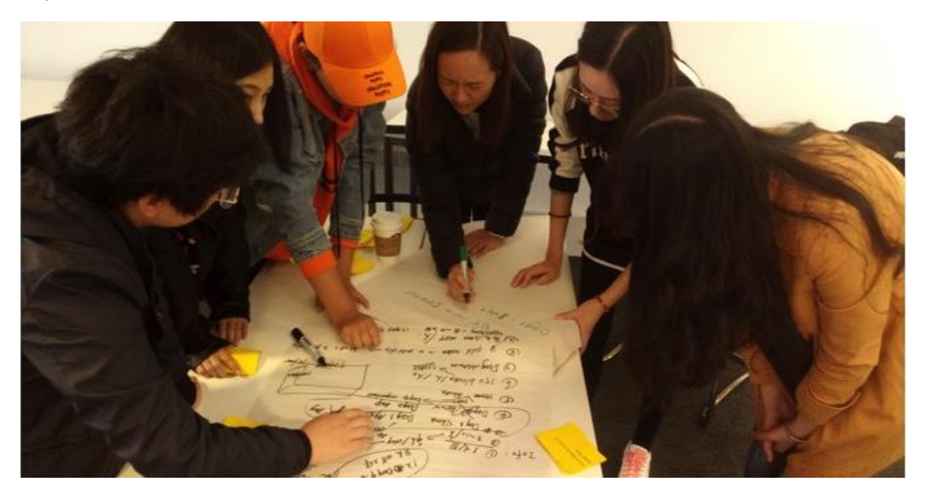
The primeval value of paper?

On the fringes of this, a bit like an acoustic guitar-playing busker, a niche practice has emerged in the world of OD facilitation which involves the digital realm being banished from the room. A sort of 'OD unplugged', so to speak.