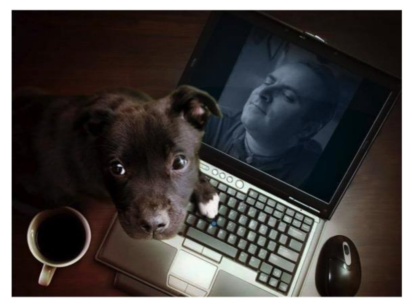
The ghost in the machine: Source: Paul Levy

the opportunities, the dark and light side of artificial intelligence, virtual and augmented reality and internet of things in OD facilitation and practice